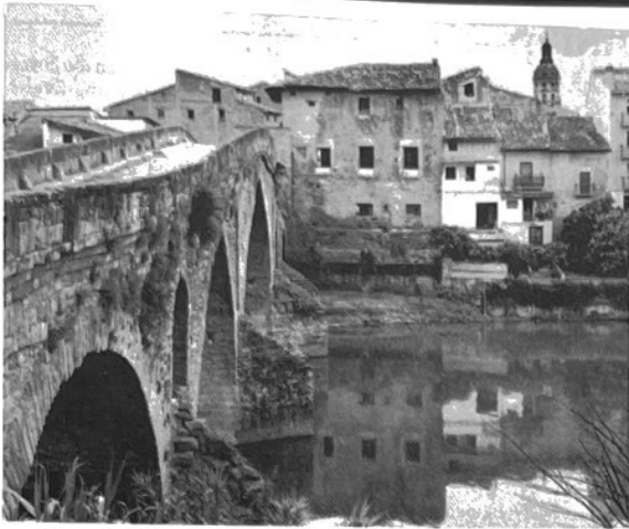
Puente la Reina, Spain, is one of the black and white photos featured in Santiago, Saint of Two Worlds at the Weil Gallery, Center for the Arts. The exhibit will be on display from Oct. 15 through Nov. 15.