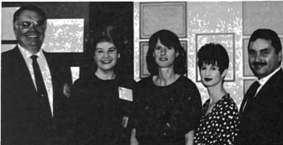
Six members of CCSU's chapter of Psi Chi, The National Honor Society in Psychology, presented research papers at the poster session of the Texas Psychological Association State Convention held in San Antonio last November.