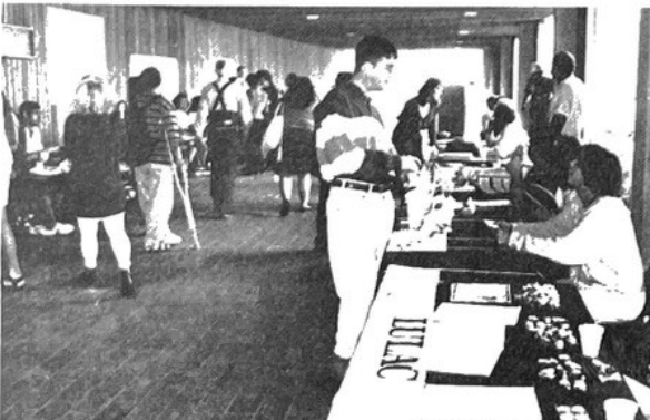
UCSO Spring Welcome attracts students--TAMU-CC students take time to visit with student organization representatives and enjoys complimentary refreshments. The event took place Jan. 27.

Direct questions to the Financial Aid Office at 994-2338.