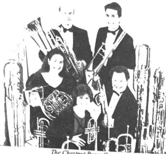
The Chestnut Brass Company