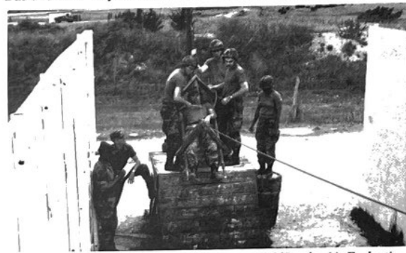
Basic camp cadets get rigorous training during Field Leadership Evaluation.

Spaces available for camp are limited, says Pierce. "We are particularly interested in students majoring in business, physical science and nursing." Interested students should contact Pierce at Classroom East (CE) 201 or call 994-2472.