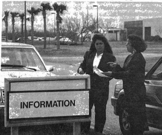
Need directions? TAMU-CC security officers are now located at both campus entrances to serve as information sources. Permanent security/information kiosks will be constructed and be ready by the fall semester.

With the Teacher Resource Center becoming a part of the complex to be known as the Early Childhood Development Center, she emphatically states, "After all these years it's finally coming to fruition."