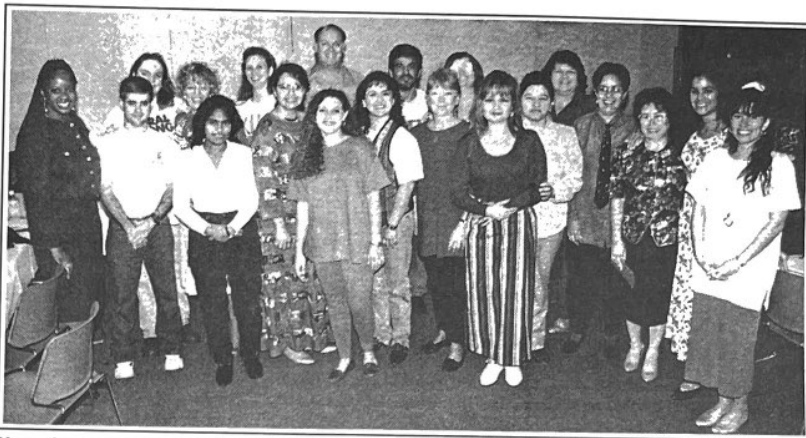
Note takers and the students they help were recognized during a luncheon at the Glascock Memorial Student Center Dec. 14.

Persons interested in becoming note takers can call 994-5951.