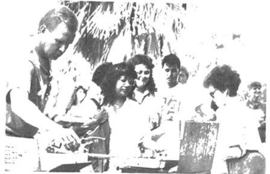
Fall Fest Returns -Fall Fest '93 will take place Thursday, September 30 from 11:00 a.m. to 2 p.m. at the fountain. A file photo from last year's event shows students lining up for free food. Hot dogs, music and fun for all will be part of the annual "welcome back" student festival this year.

Groups interested in reserving space at this year's Fall Fest should contact OSL in Room 130 of the Glasscock Memorial Student Center (GMSC) or call the office at 994-2707 by Friday, September 24.