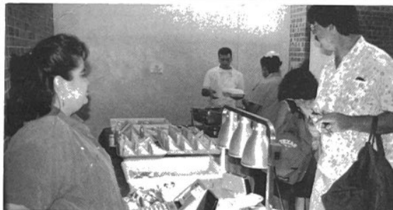
Four-minute Meal Guaranteed —The University Food Service has opened up a new fast service lunch line which guarantees a lunch in four minutes for those with exact change, or the next meal of the same item is free. The new service is located in the GMSC dining room and offers an assortment of food items along with a drink. Most of the menu is priced evenly on the dollar or half-dollar for customer convenience and faster service. Pizza by the slice, stuffed tomatoes, two hot entrees, quiche, soup, salad, fruit and desserts are just some of the choices offered to these students pictured in line.

Hours are Monday, Wednesday and Thursday, 8:00 a.m. to 5 p.m.; Tuesday, 8:00 a.m. to 7:00 p.m.; and Friday, 8:00 a.m. to 3:00 p.m. The number to call is 994-2338.